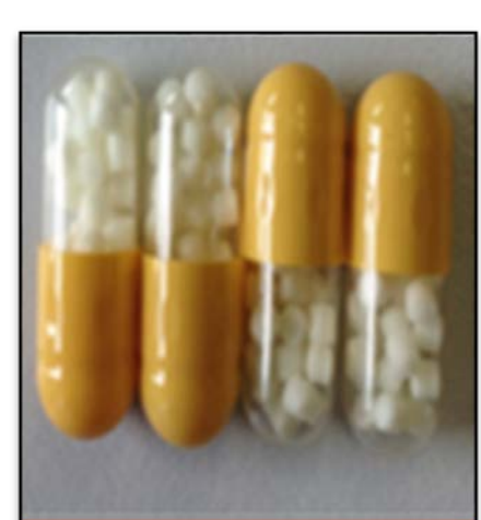
Pic 1: LPV/r Pellets ( DNDi 2016)