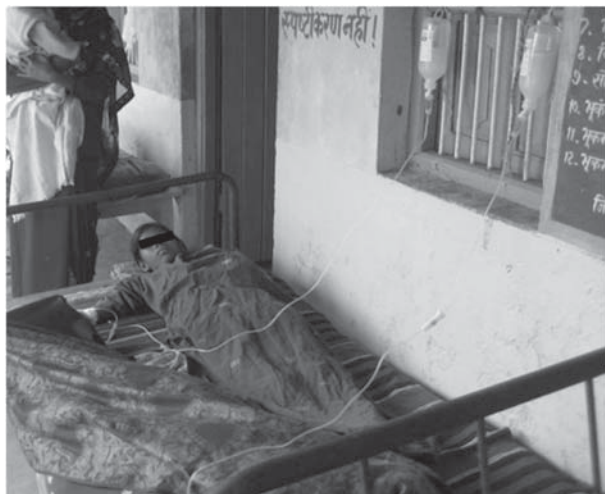
Figure 1. Young female patient with visceral leishmaniasis receiving liposomal amphotericin B infusion at Vaishali District Hospital, Bihar State, India.