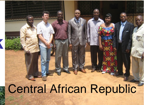
Central African Republic