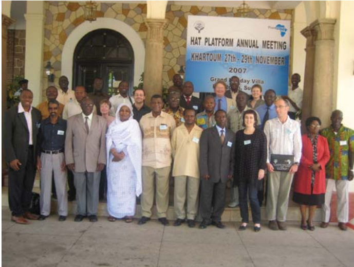
PARTICIPANTS TO THE HAT PLATFORM ANNUAL MEETING, NOVEMBER 2007, KHARTOUM, SUDAN

Upon the occasion of the Platform's Annual Meeting, it is worthwhile to remind ourselves of our main objectives, to identify our strengths and weaknesses in 2007, and to consolidate our achievements for better performance in the future.