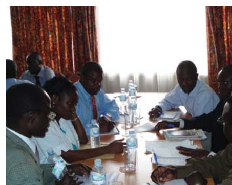
GROUPS SESSIONS DURING THE TRAINING OF ETHICS COMMITTEE MEMBERS IN KAMPALA, UGANDA