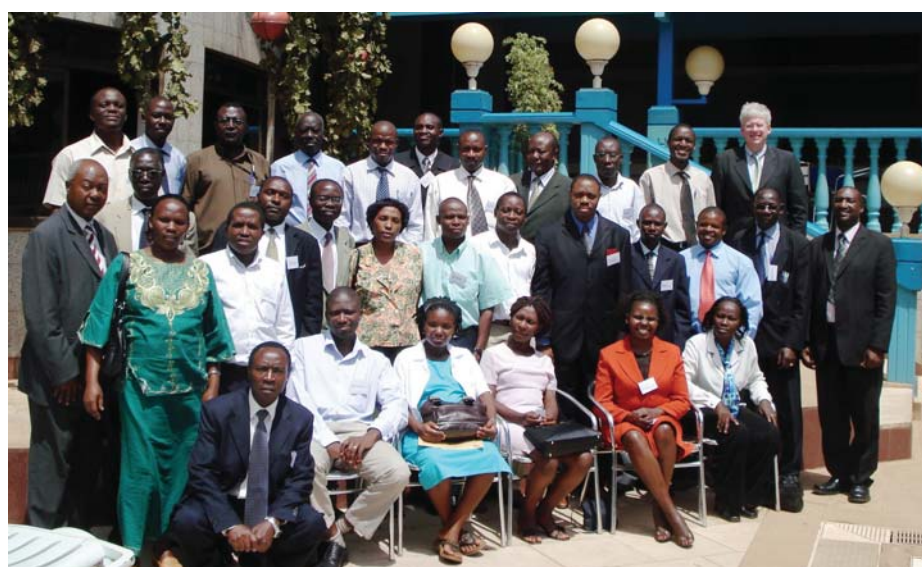
PARTICIPANTS AND FACILITATORS OF THE TRAINING OF ETHICS COMMITTEE MEMBERS, KAMPALA, UGANDA