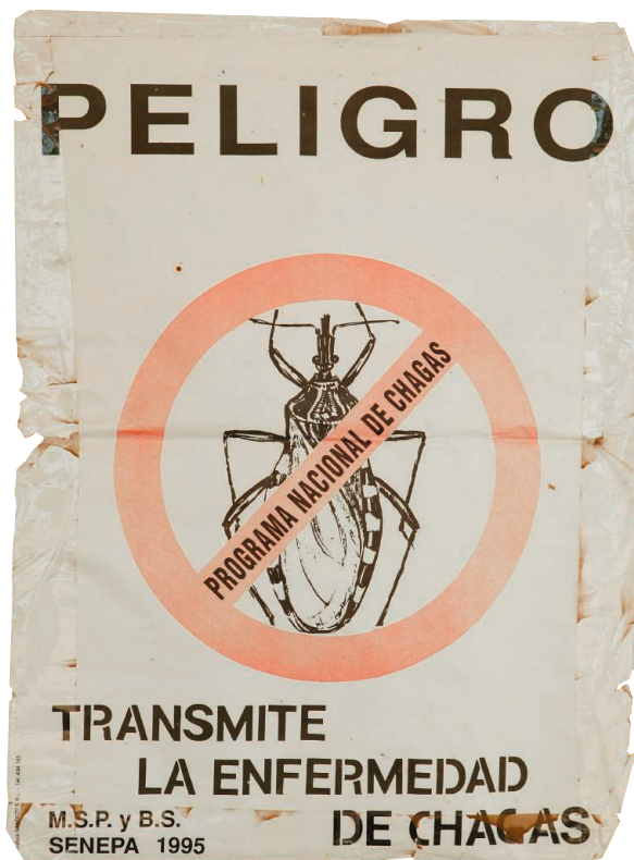
Warning signs. A poster cautions against the danger from assassin bugs, which hide out in rundown houses during the day and emerge at night to bite the inhabitants.

for Chagas drug candidates, assessing more than 300,000 molecules from a standard National Institutes of Health chemical library. By testing each compound to determine whether it slays the parasite and spares mouse cells, they have tried to weed out obviously toxic molecules. Rodriguez and colleagues eventually whittled the list to seven compounds that killed the parasite in mice.