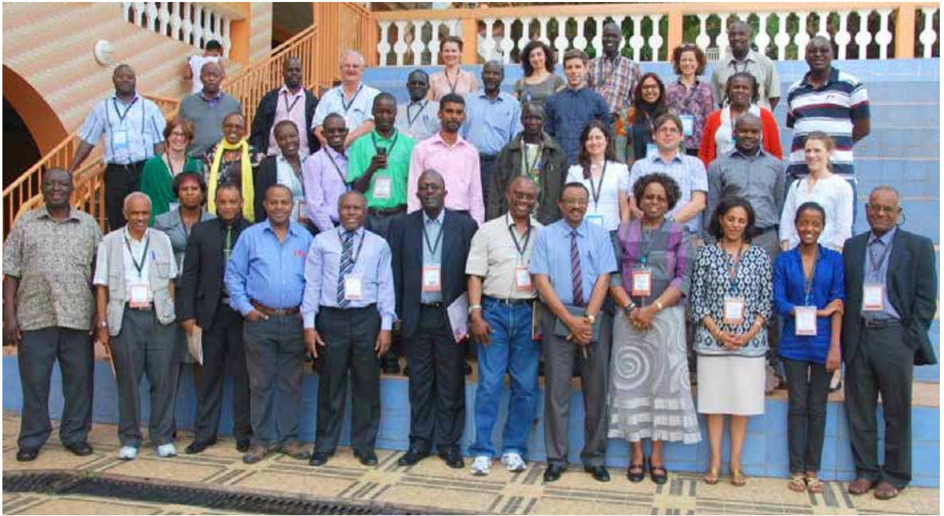
Participants who attended 20th LEAP Meeting – 11 April 2014

Held on 11 April 2014, the LEAP bi-annual meeting in Uganda set out to review current research and development (R&D) work in the region addressing the progress to date, gaps and opportunities in the field of VL. The meeting was attended by 43 members from the Leishmaniasis East Africa Platform (LEAP) countries (Kenya, Uganda, Sudan, and Ethiopia).