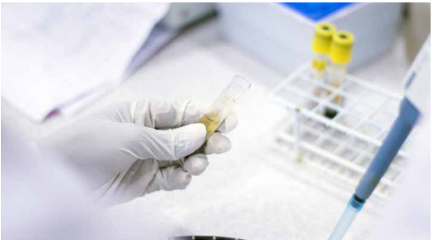
Lab technician working at the Leishmaniasis Research and Treatment Centre Laboratory – University of Gondar - 2014