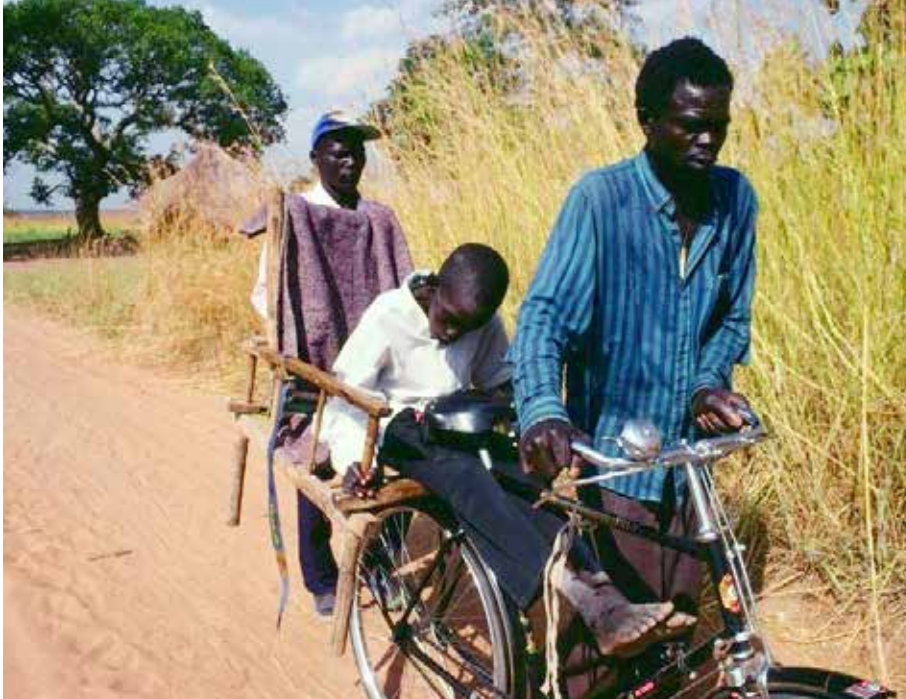
Patient suffering from kala-azar being transported to a health centre