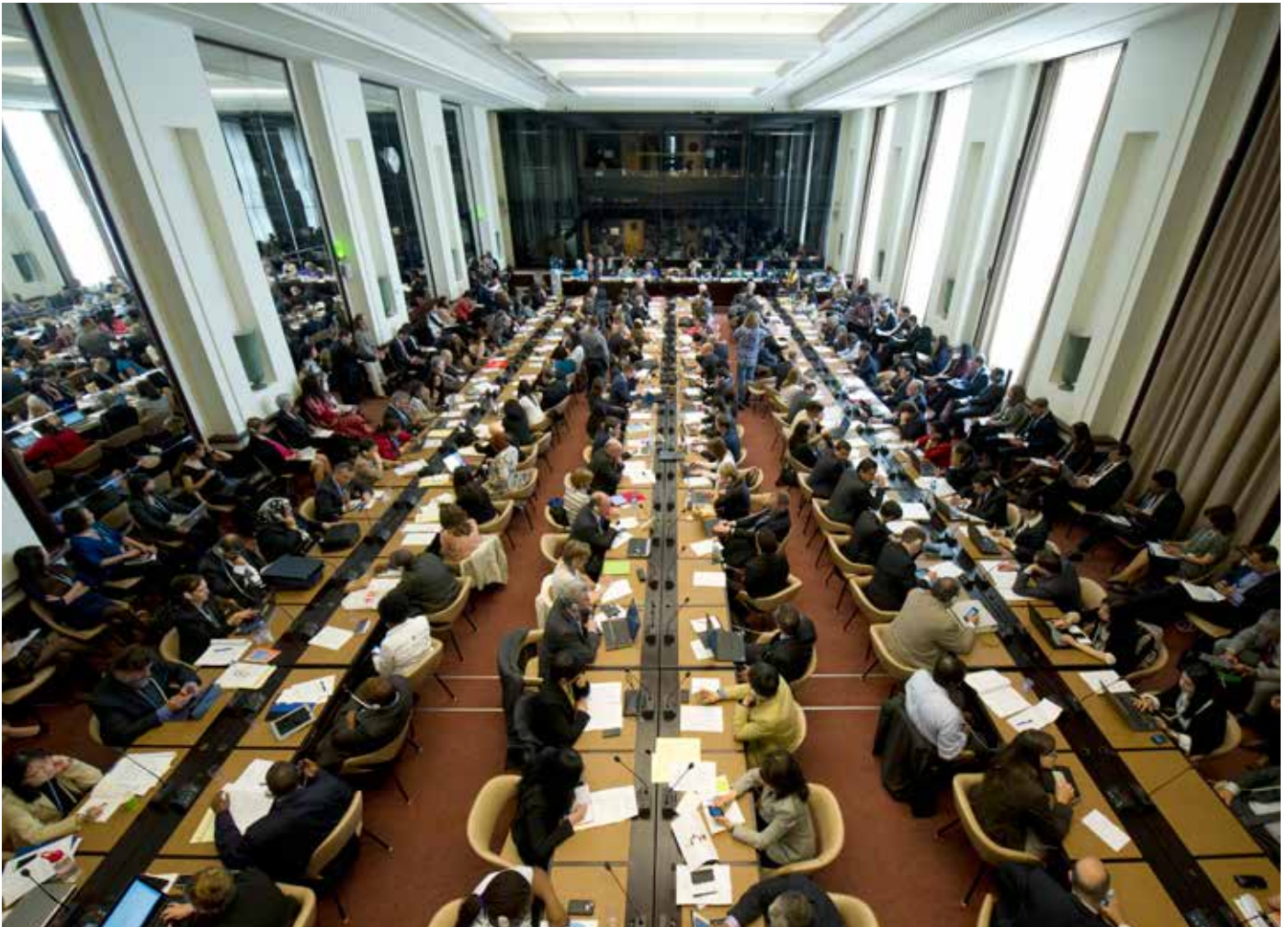
67th World Health Assembly (WHA), 2014 Technical briefing - “Strengthening health security by implementing the International Health Regulations”