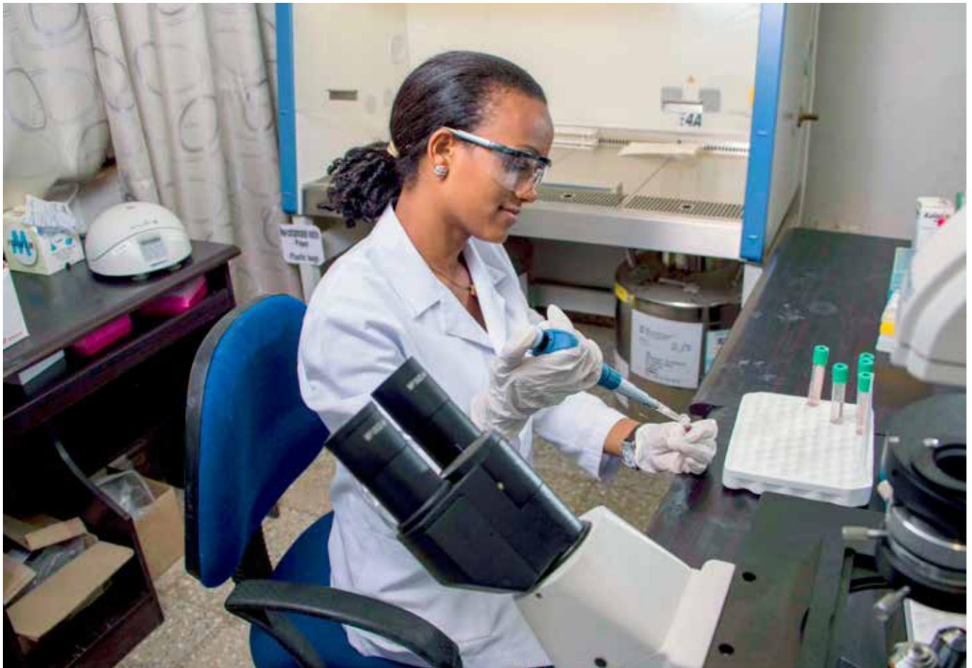
Lab technician working at the research laboratory in 2014

data produced from the research conducted at the Leishmaniasis Research and Treatment Centre. Consequently, in 2008, a new building was built within the collaboration between DNDi and the UoG that provided space to expand the laboratory, which was at the time one room with basic facilities. The objective for the expansion was to provide good quality service and data for the research.