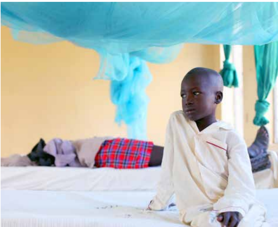
Child being examined – kala-azar causes a patient to have an enlarged spleen, and a swollen abdomen