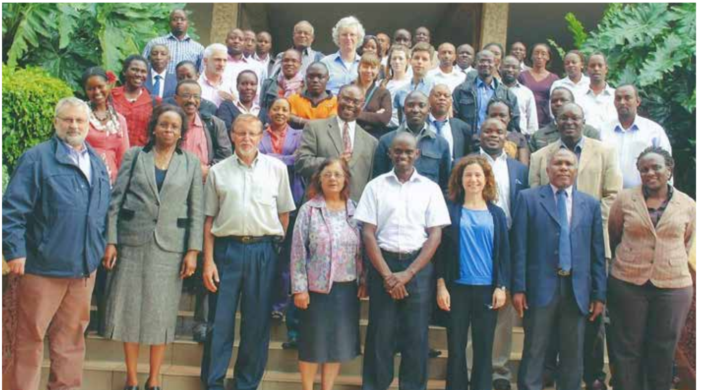
LEAP Stakeholder Meeting participants – 11 February 2014

A LEAP stakeholders meeting took place on 11 February 2014 at the Sarova Panafric Hotel in Nairobi, Kenya. The meeting was attended by 55 participants, including the LEAP Principal Investigators (PIs); Director KEMRI; scientists from KEMRI, AMREF, and MSF-Belgium; DNDi Africa regional office staff and scientists; representatives from the Kenyan Ministry of Health (MoH);