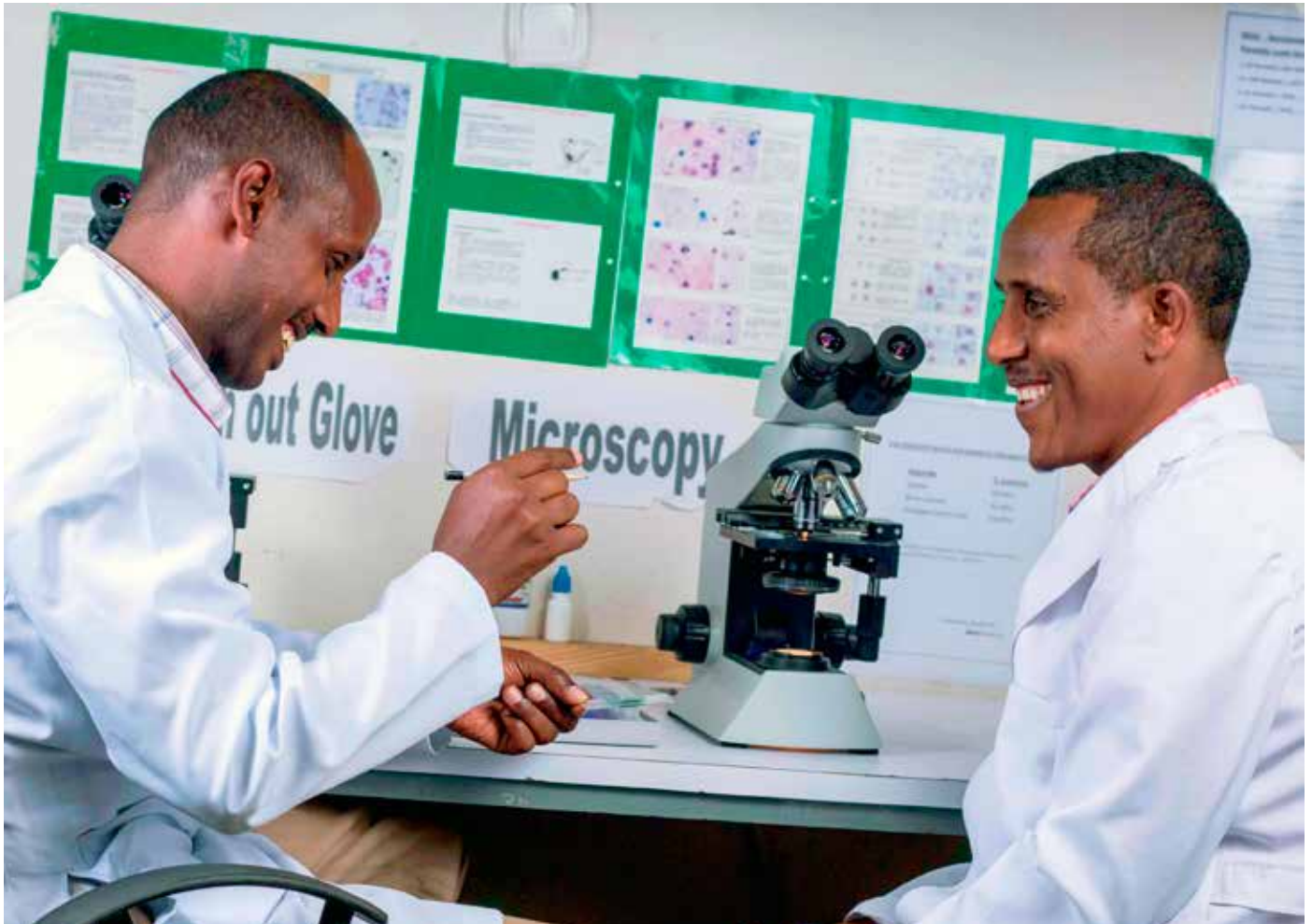
Lab technician working at the Leishmaniasis Research and Treatment Centre Laboratory – University of Gondar - 2014