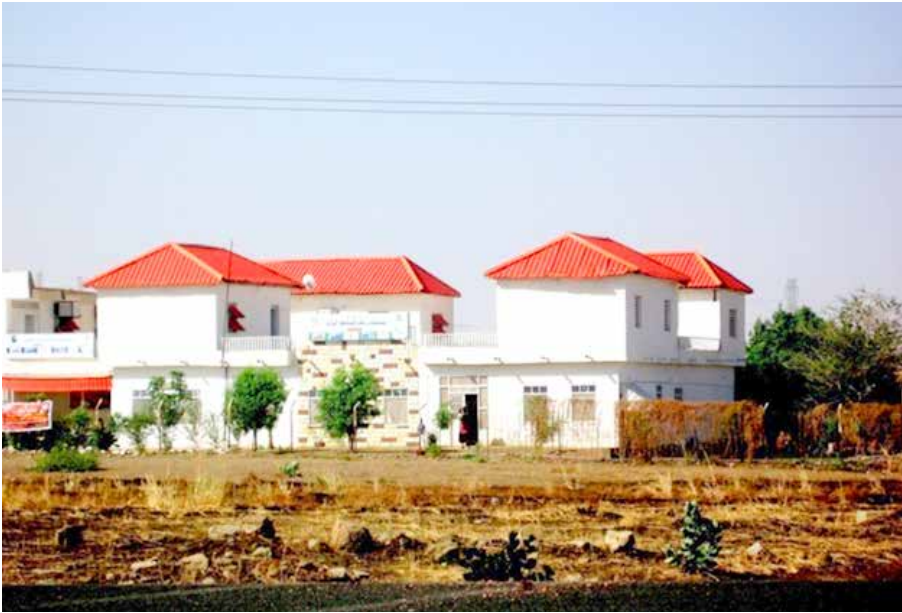
Dooka, Sudan - El Hassan Centre and Tropical Disease Hospital

A new found relationship between DNDi and Sudan began when IEND hosted a first meeting, since that time DNDi has continued to support research in several endemic diseases including kala-azar. In East Africa, DNDi worked towards establishing the Leishmaniasis East Africa Platform (LEAP), and Sudan, Kenya, Ethiopia, and Uganda took part.