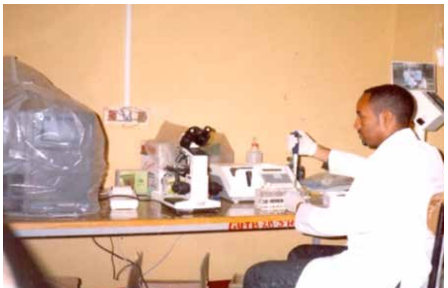
A one bench research laboratory in 2004, Gondar-Ethiopia

During the early days, the clinical trial sponsor, DNDi, and the research teams on the ground strongly believed that capacity building would bring a change to the quality of service and the quality of