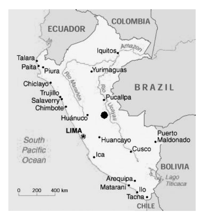
Figure I Area of the project (•).

According to reports by the Peruvian Ministry of Health (MOH), San Martin de Pangoa is the district most affected by MCL in the Satipo Province of Junin Department (Figure 1). In 1999, the prevalence of the disease was 339 cases/100 000/year, almost twice the average prevalence of 192 cases/100 000/year in the province (source of cases: UTES-Satipo). In December 2000, an assessment by Médecins Sans Frontières (MSF) using a convenience sample of 1096 persons, found 29 cases (13 cutaneous and 16 mucosal) considered as leishmaniasis based on the clinical characteristics and the history of the lesion, yielding a point prevalence of 2645 cases/100 000 inhabitants (Guthmann et al. 2000). The disease predominantly affected migrant agricultural workers who had moved to the area in recent years. These figures suggested that the prevalence of the disease was high in the general population of the district, and that a large number of patients remained untreated in the most remote and inaccessible areas of the region. Moreover, the assessment showed a number of deficiencies within the national leishmaniasis control programme, such as insufficient and poorly trained personnel and inadequate stocks of pentavalent antimonials to ensure the adequate treatment of